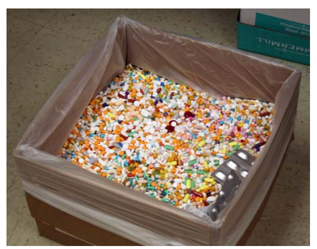
Unused Drugs at Nebraska Veterans Home, Grand Island, NE © 2007

Upon completion of the health services study, EPA hopes to understand what factors contribute to unused pharmaceutical disposal methods at health service facilities and which disposal methods represent best practices to minimize environmental impacts.