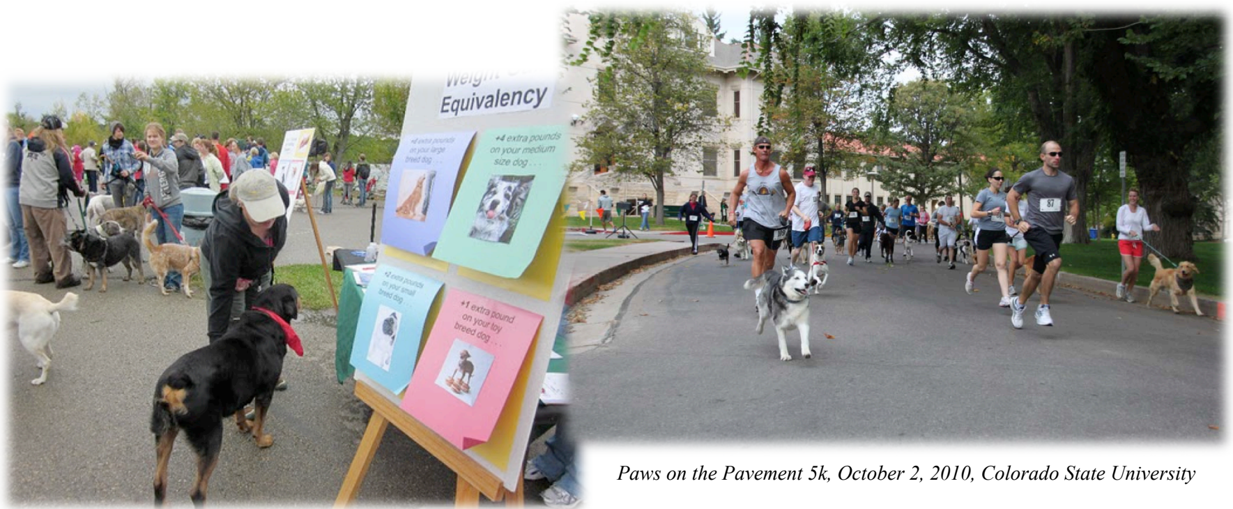
Paws on the Pavement 5k, October 2, 2010, Colorado State University