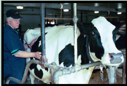
Veterinarians protect the health of livestock to ensure healthy dairy and meat products.