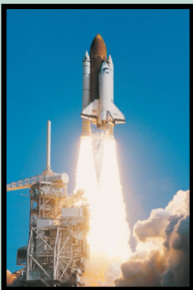
Many veterinarians work at NASA and conduct experiments in space to learn more about human and animal diseases.