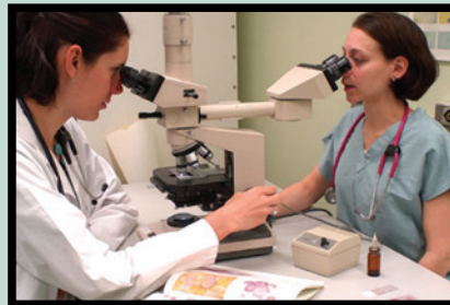
Veterinarians work in research laboratories to find cures for animal and human diseases.