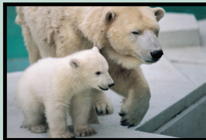
Veterinarians work with wildlife and in zoos to preserve endangered species and discover new ways to protect and restore their habitats.