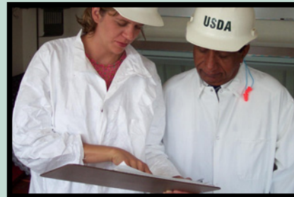
Veterinarians inspect our meat and many other foods for harmful bacteria before they are approved for people to eat.