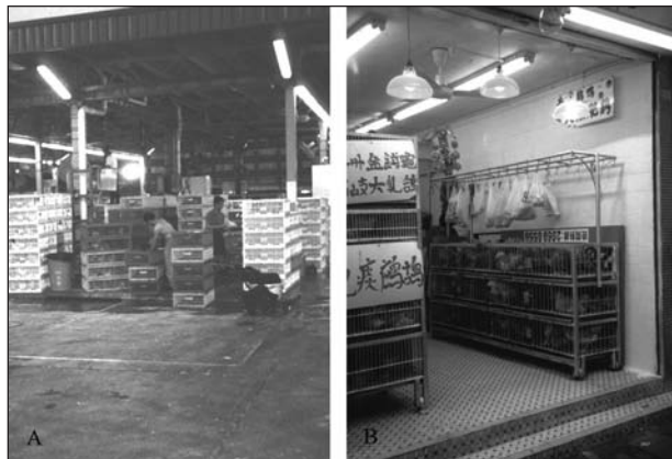
Figure 3—Wholesale poultry market at Cheung Sha Wan (A) and 1 of 1,000 retail markets in Hong Kong that provide consumers with fresh poultry meat (B). 51

Reassortment of avian- and human-adapted Influenza virus A —Avian influenza viral genes have rarely appeared in human-adapted influenza A viruses; however, they have resulted from reassortment of gene segments between more than 1 influenza A virus. 31,32 Such a reassortment event is rare, but consistent with the long spans between the emergence of new human pandemic influenza viruses. 23 Two reassortment events between AI and human-adapted influenza viruses caused pandemics of human influenza during 1957 and 1968. Nucleotide sequence data indicate the 1957 (H2N2) human pandemic influenza viruses resulted from reassortment of 3 (hemagglutinin, neuraminidase, and polymerase B1) AI viral genes with 5 (matrix, polymerase B2, polymerase A, nonstructural, and nucleoprotein) human influenza viral genes. 33-35 The 1968 (H3N2) pandemic virus resulted from reassortment of 2 (hemagglutinin and polymerase B1) AI viral genes with 6 human influenza viral genes. Direct infection of humans with AI viruses makes such a reassortment event feasible. At the end of 1997, depopulation of infected poultry in Hong Kong before the onset of human influenza season may have forestalled a reassortment event and prevented another human influenza pandemic. Swine have been proposed as a “mixing vessel” for coinfection by influenza viruses from birds and mammals, with reassortment of gene segments and development of hybrid strains having the ability to infect people and other mammals. 36